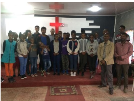
Merri Mekane Yesus Youth Trainees