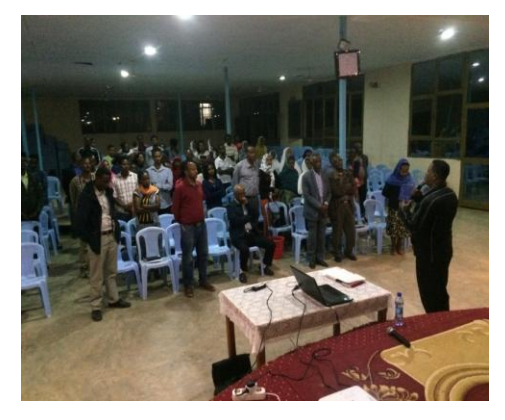
Harer Leadership 'Bell Wringing' Session

A similar hand on training for 35 leaders , 53 Parents and 161 Youth was conducted in cooperation with Hawassa Piassa Mulu Wongel from September 21-23 , 2018 . Contents are similar to the above except that instead of 'Starting Decent family'; Quiet Time with the Lord was given for Youth.