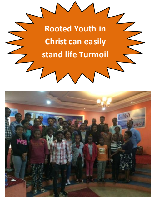
Harer Youth Training Participants

The content for church leaders focused on: 'Ringing bell' messages so that non God fearing generation may not emerge. Content for Parents included Seven Spiritual Pillars , preceded by Biblical Child Raising , while that for Youth (separate session) covered Five Spiritual Pillars , especially prepared for them, preceded by Youth Challenges & Possible Solutions . Starting Family in Decency was also part of content for youth.