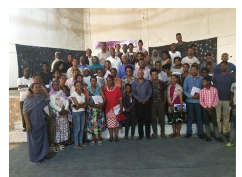
Adama Parenting Trainees

training. Maximum of 75 attendants were in session.