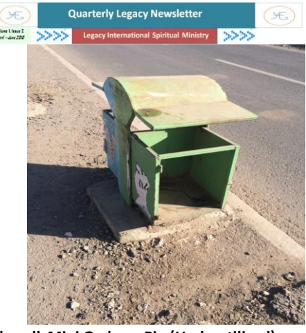
Sidewalk Mini Garbage Bin (Underutilized)

Case 2: A young lady threw a tissue paper on side walk at near Bus Stop shade. Noting the action, the writer of this article pointed out to the lady the availability of a garbage bin attached to the Bus Stop shade.