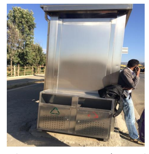
Garbage Bin at Bus Station (Not much noticeable)

She immediately bent down, picked it and threw into the bin prepared for the purpose.